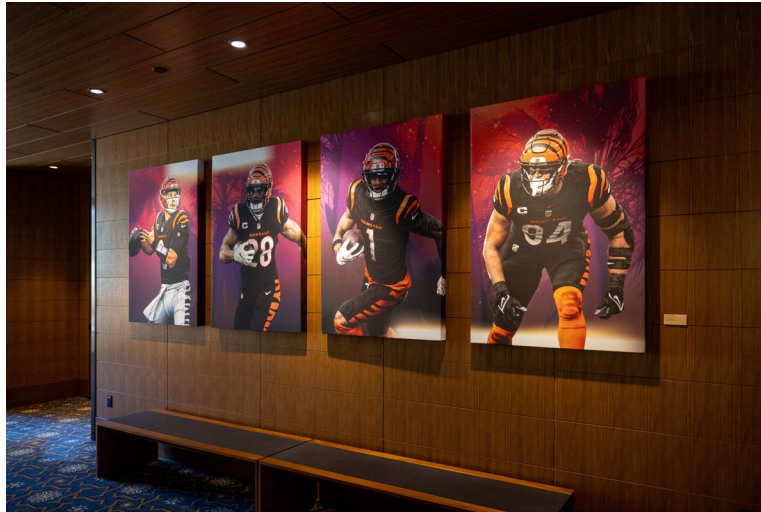
2 nd Floor Outside of Legacy AB