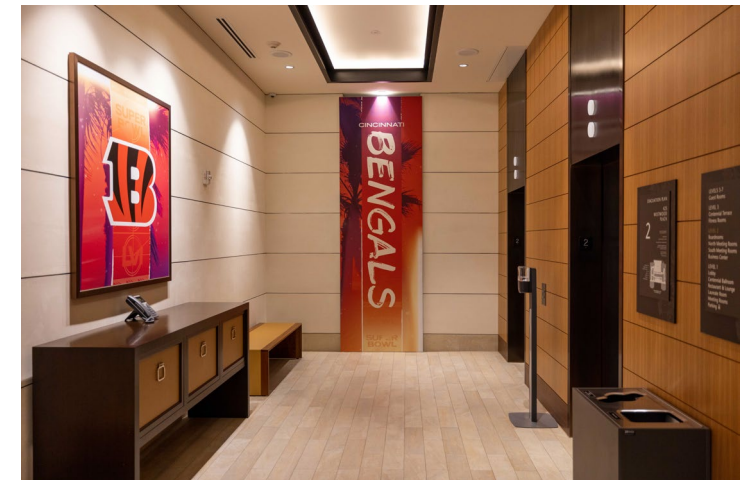
2 nd Floor Elevator Lobby