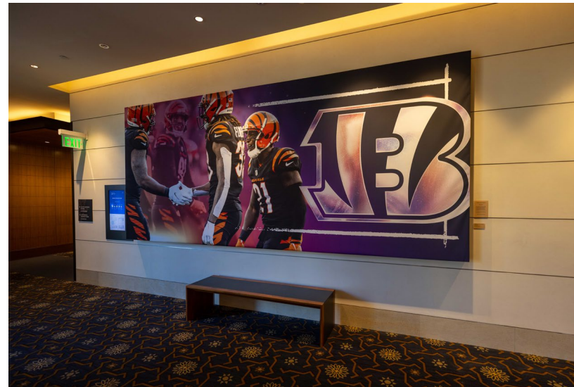
2 nd Floor Top of Stairs