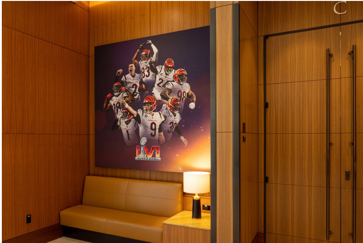
Outside of Main Ballroom