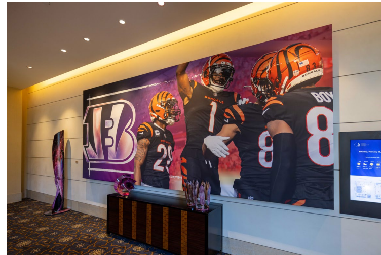
2 nd Floor Top of Stairs