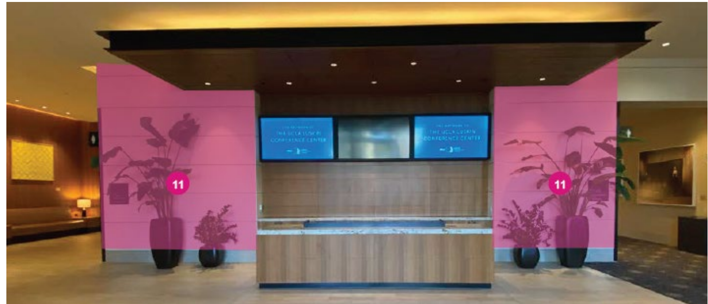
LCC VIP Event Check-In