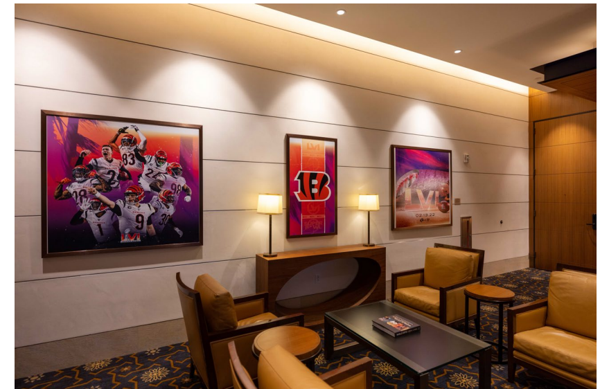
2 nd Floor Lounge Outside of Exploration