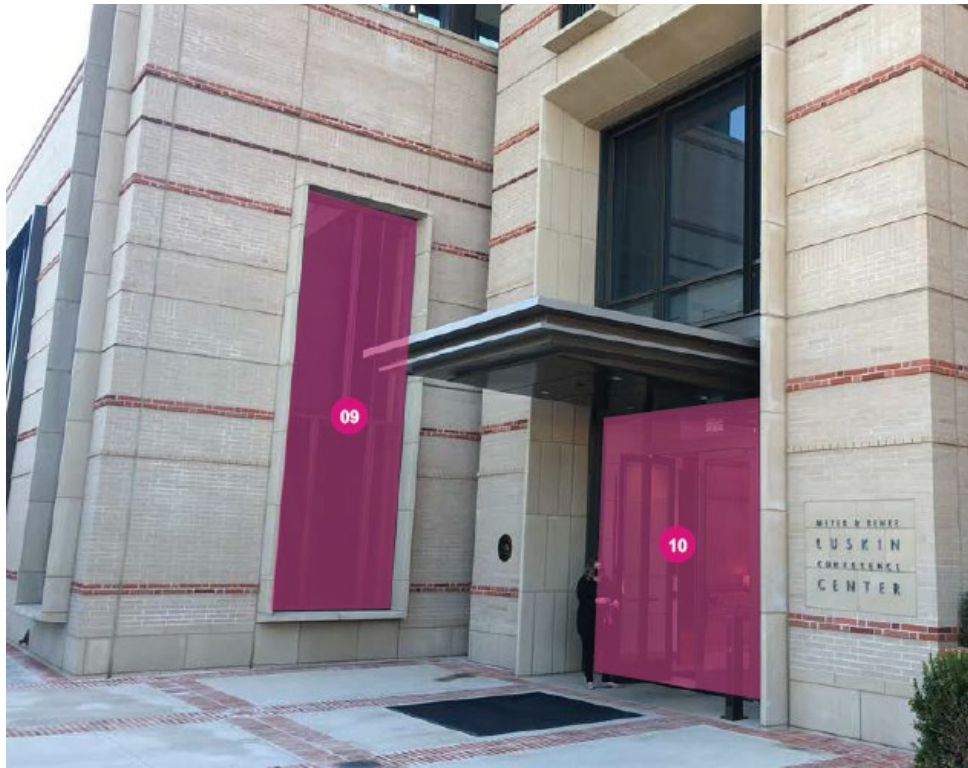
LCC VIP Event Entrance