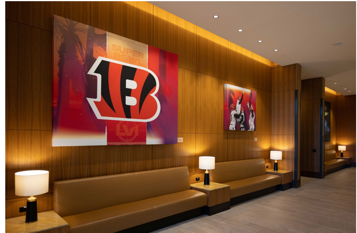
Outside of Main Ballroom