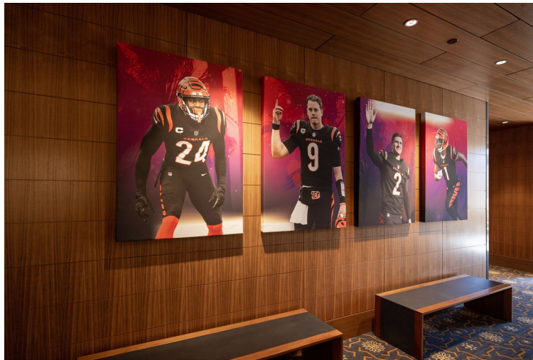
2 nd Floor Outside of Optimist AB